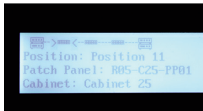
MCP Graphic LCD