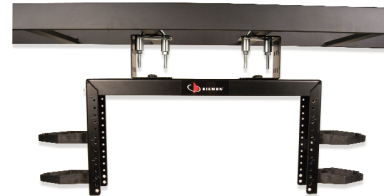
Parallel to Ladder Rack (Below)

Because we continuously improve our products, Siemon reserves the right to change specifications and availability without prior notice.