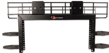
Parallel to Tray (Flush)