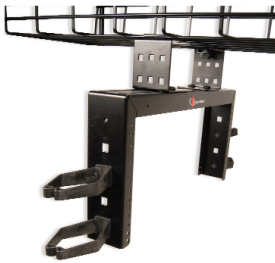
Perpendicular to Tray (Below)