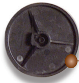
Durable LC polishing puck