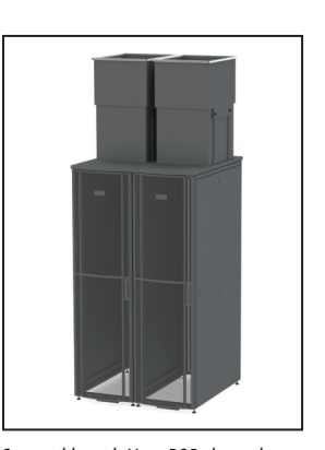
Compatible with VersaPOD thermal management options including exhaust fans and brush guards. V62A cabinet is compatible with VersaPOD Vertical Exhaust Ducts.