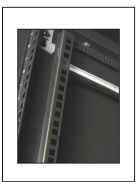
Fully adjustable mounting rails can be readily configured to support any range of equipment depths

Contoured high density perforated door provides 71% perforation exceeding major IT equipment air flow requirements