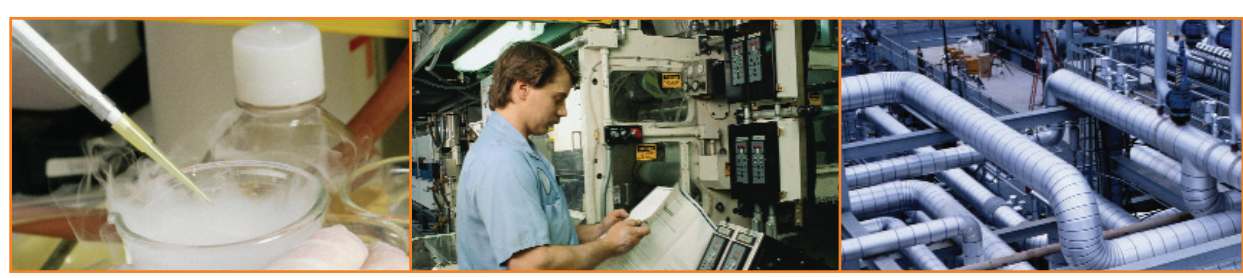
R&D labs develop, design and implement rigorous testing programs using sophisticated instrumentation. The Industrial LC provides reliability with leading edge technology for applications where highly accurate performance is critical.