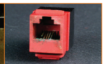
Humidity corrodes contact pins inside typical outlets. Repeated exposure can eventually destroy the contact pins, rendering the outlet unusable. The Industrial MAX outlet's special housing prevents this corrosion.