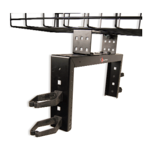
Perpendicular to Tray (Below)