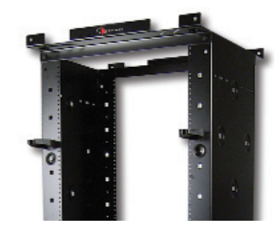
Siemon has developed a extended depth RS rack for managing extra large volumes of horizontal cable

Vertical Patching Channels are available in standard 152mm (6 in.) version or new high capacity 304mm (12 in.) version